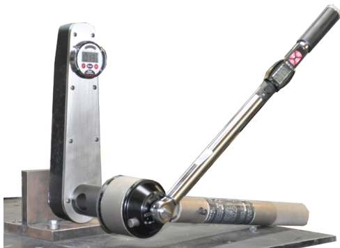
Torque Multiplier Output Display