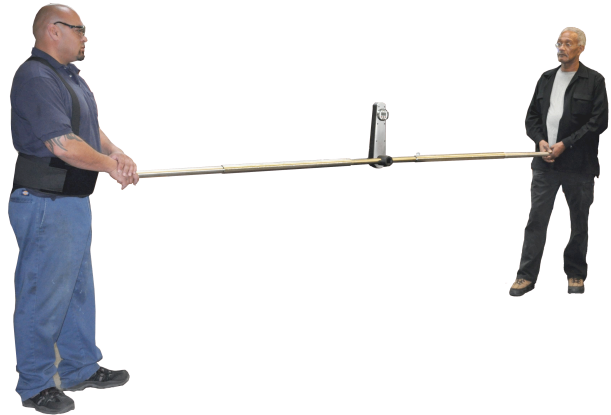
2000 ft.lb. Torque wrench shown with 5 Extensions (two man use)